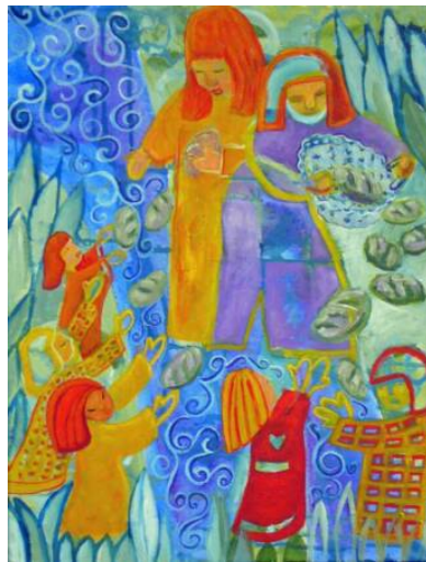
Feed My Lambs

A portion of her sales benefit Safezone, a resource center for homeless teens in St Paul. For more information, visit her website at www.artdeanne.com .